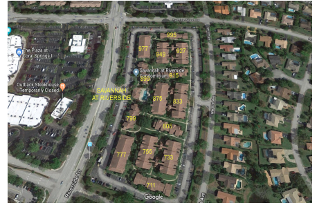
Built in 1988 - 240 units - 3 floors