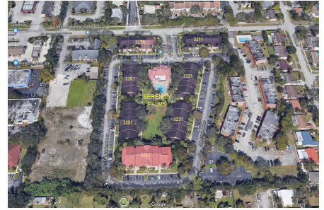
Built in 2006 - 118 units - 3 floors

Serenity Palms 3201 Sabal Palm Manor, Davie, FL 33024 Phone: +1 954-447-1050 http://serenity-palms-davie.com/