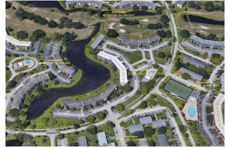
Built in 1975 - 228 units - 4 floors

LYNDHURST AT CENTURY VILLAGE EAST MASTER MANAGEMENT 3501 West Drive Deerfield Beach, FL 33442 tel: 954-421-55 https://centuryvillageeast.com/coocve/