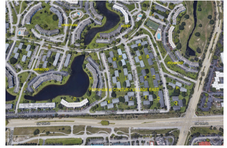
Built in 1974/1976 - 484 units - 4 floors

Farnham "A" Condominium Association, Inc. Address: 17 Farnham A, Deerfield Beach, FL 33442