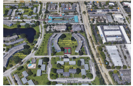
Built in 1978 - 144 units - 4 floors