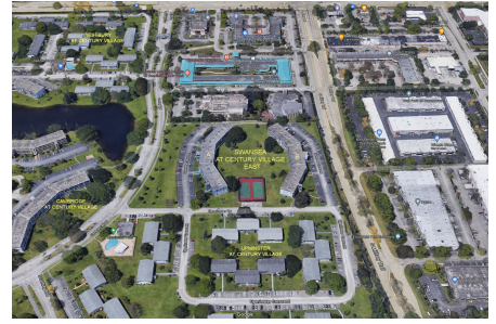
Built in 1978 - 144 units - 4 floors