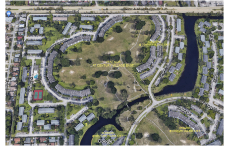
Built in 1978 - 544 units - 4 floors