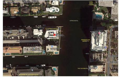
Built in 2015 - 11 units - 5 floors