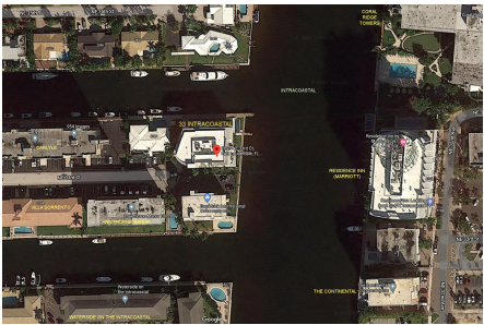
Built in 2015 - 11 units - 5 floors