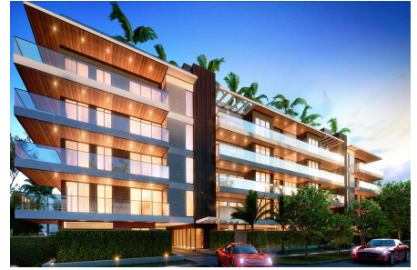
Built in 2016 - 16 units - 4 floors

Aqualuna Las Olas Condominium Assn Inc 20 Isle Of Venice Drive Fort Lauderdale, FL 33301 Phone: (954) 767-3352 (954) 530-7116