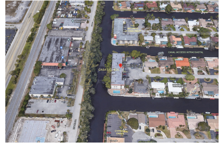
Built in 1983 - 23 units - 3 floors