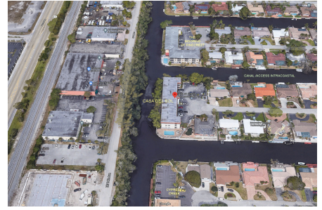
Built in 1983 - 23 units - 3 floors