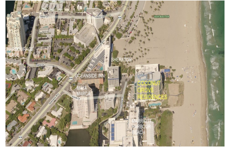
Built in 2008 - 63 units - 12 floors

Number of units: 63 Number of active listings for rent: 0 Number of active listings for sale: 0 Building inventory for sale: Number of sales over the last 12 months: 0% Number of sales over the last 6 months: 0 Number of sales over the last 3 months: 0