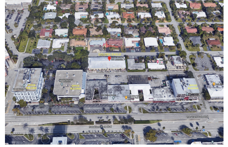
Built in 1979 - 23 units - 2 floors

Golden Eagle Condo Address: 2624 NE 32nd St, Fort Lauderdale, FL 33306