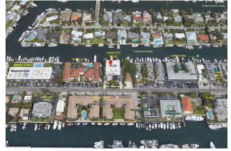
Built in 2022 - 10 units - 5 floors

Harbor's Edge Address: 1507 SE 15th St, Fort Lauderdale, FL 33316 Phone: +1 954-451-0014