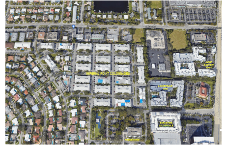
Built in 1971 - 552 units - 2 floors

Imperial Point Colonnades 2156 NE 67 Street Ft. Lauderdale, FL 33308 Office: (954) 491-2400 Fax: (954) 491-2462 http://www.imperialpointcolonnades.com/default.php