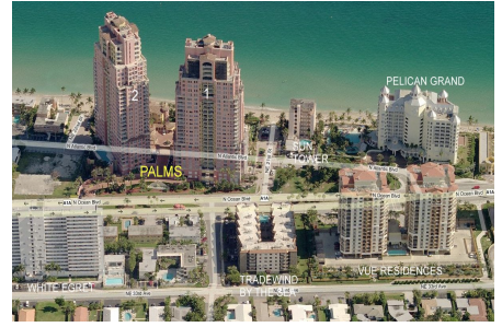
Built in 2000 - 89 units - 30 floors