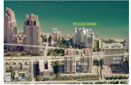
Built in 2007 - 159 units - 11 floors

Pelican Grand Beach Resort Condominium Association, Inc (954) 568-9431