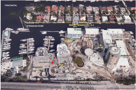
Built in 2024 - 31 units - 5 floors