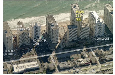
Built in 1975 - 370 units - 28 floors

Playa Del Sol Condominium Association (954) 565-2507