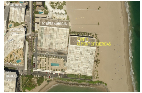
Built in 1970 - 281 units - 30 floors

Point of Americas 2 apartments (954) 522-5446 http://www.pointofamericas2.com/