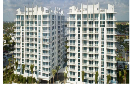
Built in 2009 - 86 units - 12 floors

Sapphire Fort Lauderdale Condo Association (954) 537-1837