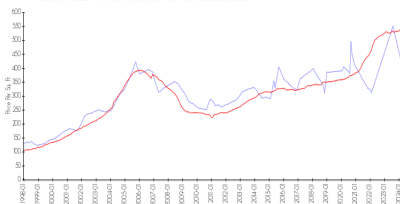
Shore Club Tower 1 (South) vs Fort Lauderdale

Shore Club Tower 1 (South): $400/sq. ft. Fort Lauderdale: $528/sq. ft.