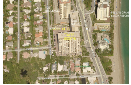
Built in 1977 - 95 units - 17 floors

Shore Club Condominium Association 954-561-2623