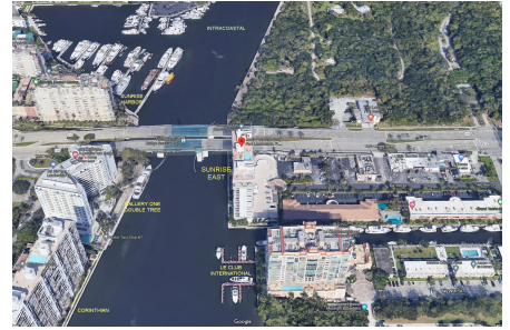
Built in 1969 - 93 units - 20 floors

Sunrise East Condominium Address: 2800 E Sunrise Blvd, Fort Lauderdale, FL 33304 Phone: +1 954-564-9644