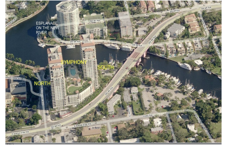
Built in 2006 - 187 units - 21 floors

Symphony Condominium Association (954) 522-1141