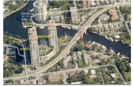
Built in 2006 - 151 units - 21 floors

Symphony Condominium Association (954) 522-1141