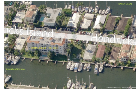
Built in 2004 - 14 units - 5 floors

TERRACES OF THE ISLES OWNER ASSOCIATION, INC AMORELLO PROPERTY MGMT GROUP INC PHONE 954-476-6767