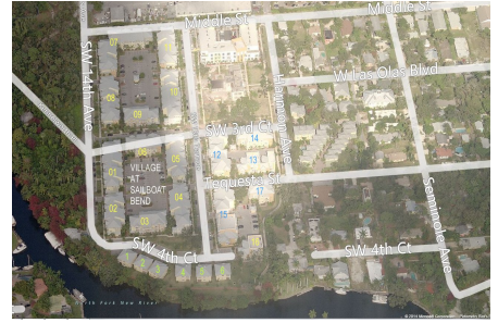
Built in 2005 - 215 units - 3 floors

The Village At Sailboat Bend Condo C Assn 340 Sw 14th Avenue Fort Lauderdale, FL 33312 Phone: (954) 596-5504