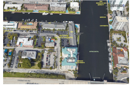
Built in 2006 - 60 units - 3 floors

Waterside on the Intracoastal Address: 2881 NE 32nd St, Fort Lauderdale (954) 563-2480