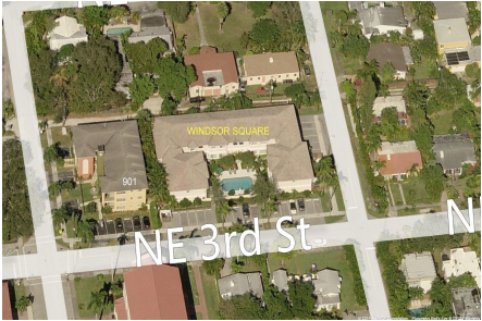
Built in 1990 - 11 units - 2 floors