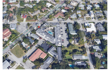
Built in 2006 - 46 units - 2 floors