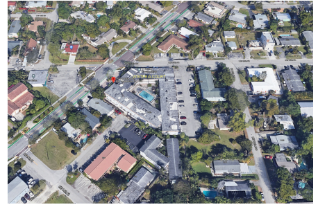
Built in 2006 - 46 units - 2 floors