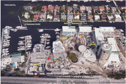
Built in 2024 - 29 units - 10 floors