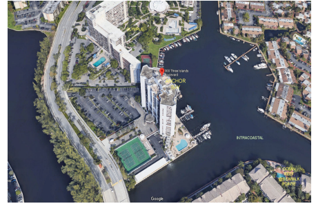
Built in 1987 - 158 units - 22 floors

Anchor Bay Club Condo Association 300 Three Islands Blvd Hallandale Beach, FL 33009 Phone (954) 458-4885 Phone (954) 995-3543 Fax (954) 944-3165 Viber (954) 608-7014 https://anchorbayclubhallandale.com/