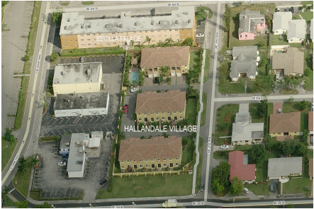
Built in 2007 - 13 units - 2 floors