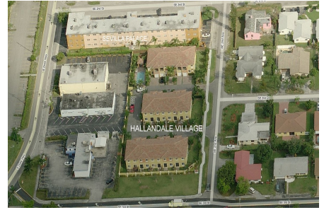
Built in 2007 - 13 units - 2 floors

Number of units: 13 Number of active listings for rent: 0 Number of active listings for sale: 0 Building inventory for sale: Number of sales over the last 12 months: 0% Number of sales over the last 6 months: 1 Number of sales over the last 3 months: 0