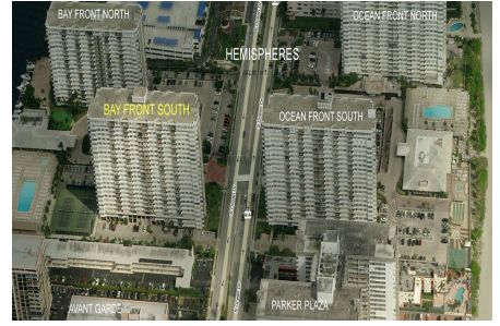
Built in 1973 - 335 units - 23 floors