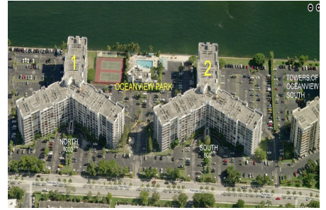
Built in 1977 - 591 units - 10 floors

Oceanview Park Condominium Association 1000 Parkview Dr Apt 607 Hallandale Beach, FL 33009 (954) 454-8401