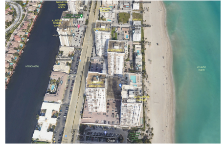
Built in 1981 - 203 units - 27 floors

Quadomain Condominium Association Inc 2201 South Ocean Drive # 2 Hollywood, FL 33019 (954) 921-8902 http://www.quadomainweb.com/quadomain/outside_home.asp