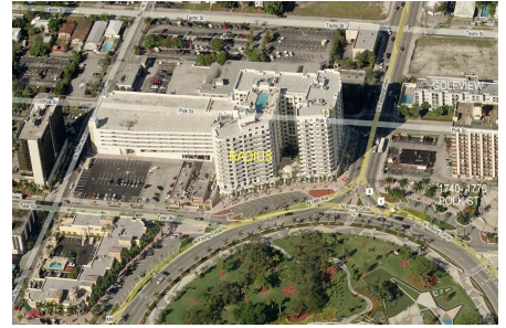
Built in 2008 - 311 units - 13 floors