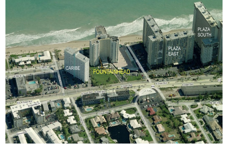
Built in 1995 - 130 units - 16 floors

http://www.fountainheadbythesea.com/about-me/