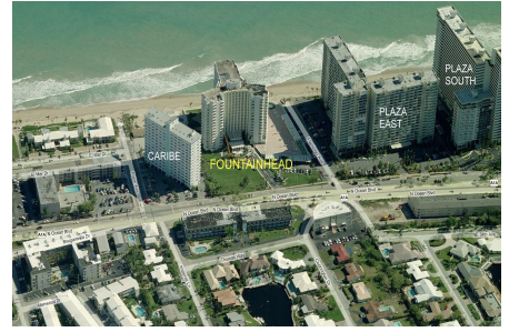
Built in 1995 - 130 units - 16 floors

http://www.fountainheadbythesea.com/about-me/