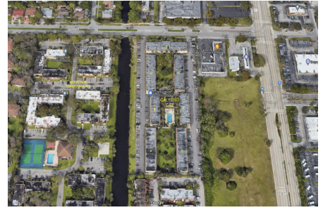
Built in 2006 - 106 units -

The Calypso Cay 4160 NW 21st St, Lauderhill, Florida, 33313 (305) 602-0908 http://www.calypsocaylauderhill.com