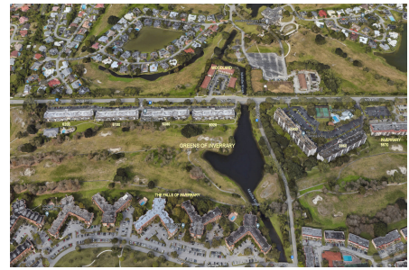
Built in 1974 - 432 units in total - 6 floors

The Greens of Inverrary Management Company: Fyve Property Management, Inc. 5100 W. Copans Road, Suite 100 Margate, Florida 33063 954-741-8811 Property Manager: ext. 1208 Sales & Lease Applications: ext. 1204 Maintenance Payments: ext. 1078 https://www.thegreensofinverrary.com/