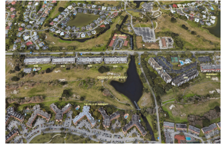
Built in 1974 - 432 units in total - 6 floors

The Greens of Inverrary Management Company: Fyve Property Management, Inc. 5100 W. Copans Road, Suite 100 Margate, Florida 33063 954-741-8811 Property Manager: ext. 1208 Sales & Lease Applications: ext. 1204 Maintenance Payments: ext. 1078 https://www.thegreensofinverrary.com/