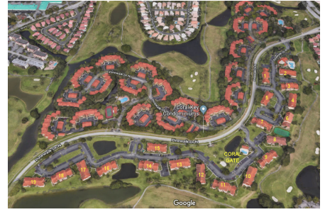
Built in 1990 - 364 units - 2 floors

Coral Gate Condominium Association Address: 6350 Coral Lake Dr, Margate, FL 33063, Phone: +1 954-971-2434