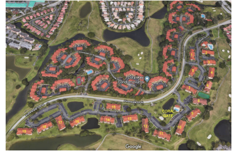
Built in 1990 - 364 units - 2 floors

Coral Gate Condominium Association Address: 6350 Coral Lake Dr, Margate, FL 33063, Phone: +1 954-971-2434