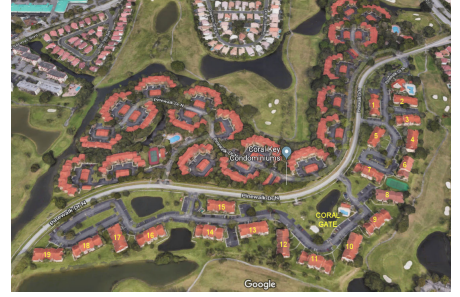
Built in 1990 - 364 units - 2 floors

Coral Gate Condominium Association Address: 6350 Coral Lake Dr, Margate, FL 33063, Phone: +1 954-971-2434