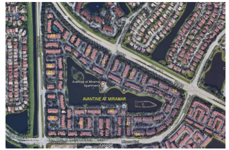
Built in 2003 - 848 units - 2 floors

Aventine at Miramar HOMEOWNERS/CONDO ASSOCIATION 2436 Centergate Drive Miramar, FL 33025 (954) 435-464