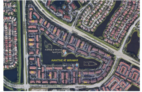
Built in 2003 - 848 units - 2 floors

Aventine at Miramar HOMEOWNERS/CONDO ASSOCIATION 2436 Centergate Drive Miramar, FL 33025 (954) 435-464