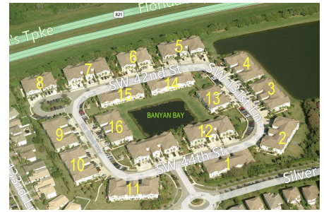
Built in 2005 - 164 units - 2 floors

Banyan Bay Condominium Association 13150 Silver Falls Boulevard Miramar, FL 33027 Office: (305) 677-9580 Fax: (305) 200-1411 Email: manager@silverfallshoa.com