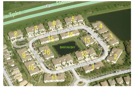
Built in 2005 - 164 units - 2 floors

Banyan Bay Condominium Association 13150 Silver Falls Boulevard Miramar, FL 33027 Office: (305) 677-9580 Fax: (305) 200-1411 Email: manager@silverfallshoa.com