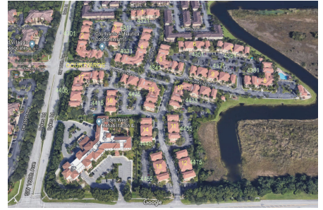
Built in 2002 - 336 units - 2 floors

Courtyards At Nautica Condominium Association Address: 4525 SW 160th Ave, Miramar, FL 33027 Phone: +1 954-441-2274 https://www.courtyardsatnautica.com/