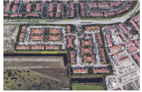
Built in 2007 - 190 units - 2 floors

Martinique At Miramar Community Association, Inc 1145 Sawgrs Corp Parkway Sunrise, FL 33323 Phone: (954) 846-1225