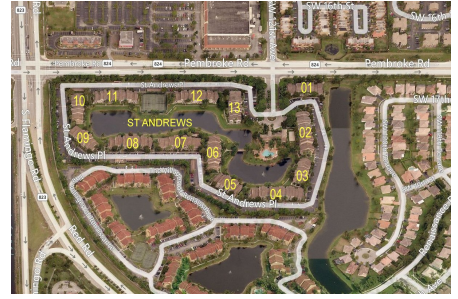
Built in 1993 - 332 units - 3 floors

St. Andrews of Miramar Condominium Complex Address: 12100 St Andrews Pl, Miramar, FL 33025, Phone:(954) 885-9484