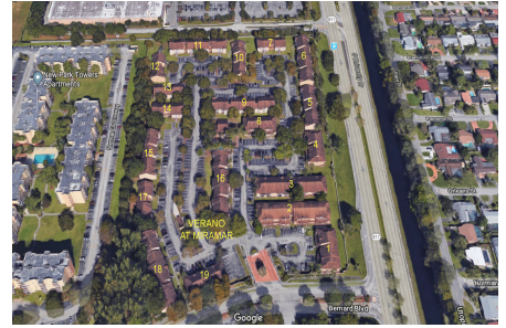
Built in 1986 - 220 units - 2 floors

Verano At Miramar Condominium Association Inc 7900 NW 155th Street Miami Lakes, FL 33016 Phone: (305) 225-7522