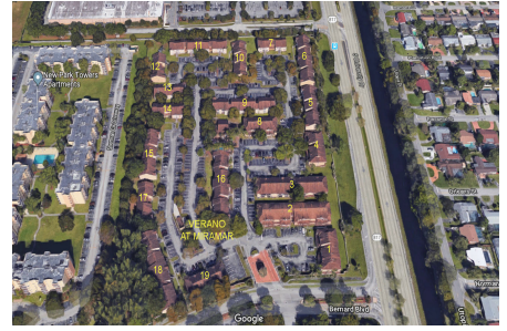
Built in 1986 - 220 units - 2 floors

Verano At Miramar Condominium Association Inc 7900 NW 155th Street Miami Lakes, FL 33016 Phone: (305) 225-7522