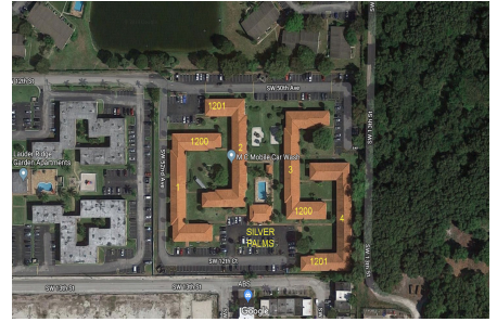
Built in 1975 - 100 units - 2 floors