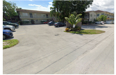
Built in 2006 - 40 units - 2 floors