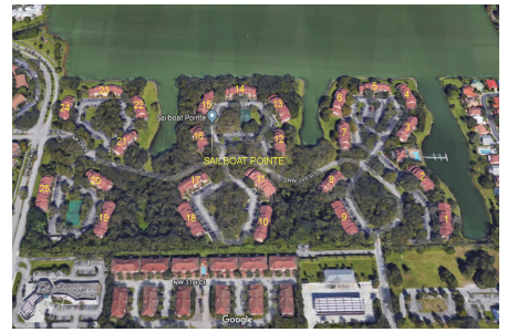
Built in 1992 - 376 units - 3 floors

Sailboat Pointe Condominium Association Inc 2325 NW 33rd St, Oakland Park, FL 33309 (954) 677-9489