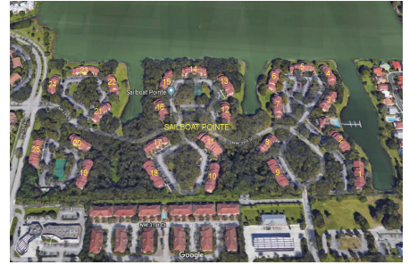
Built in 1992 - 376 units - 3 floors

Sailboat Pointe Condominium Association Inc 2325 NW 33rd St, Oakland Park, FL 33309 (954) 677-9489