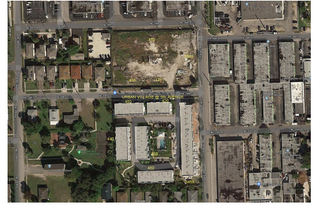
Built in 2018 - 90 units - 3 floors

Urban Village on Fifth Avenue 3351 N Andrews Ave Oakland Park, FL 33309 +1 954-451-5167