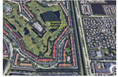
Built in 1988 - 620 units - 4 floors

Century Village Pembroke Pines 13800 SW 5th Ct, Pembroke Pines, FL 33027 (954) 431-2137