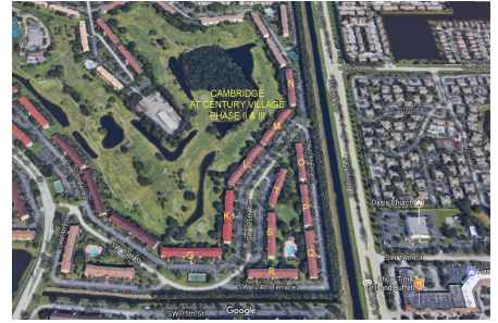
Built in 1988 - 620 units - 4 floors

Century Village Pembroke Pines 13800 SW 5th Ct, Pembroke Pines, FL 33027 (954) 431-2137